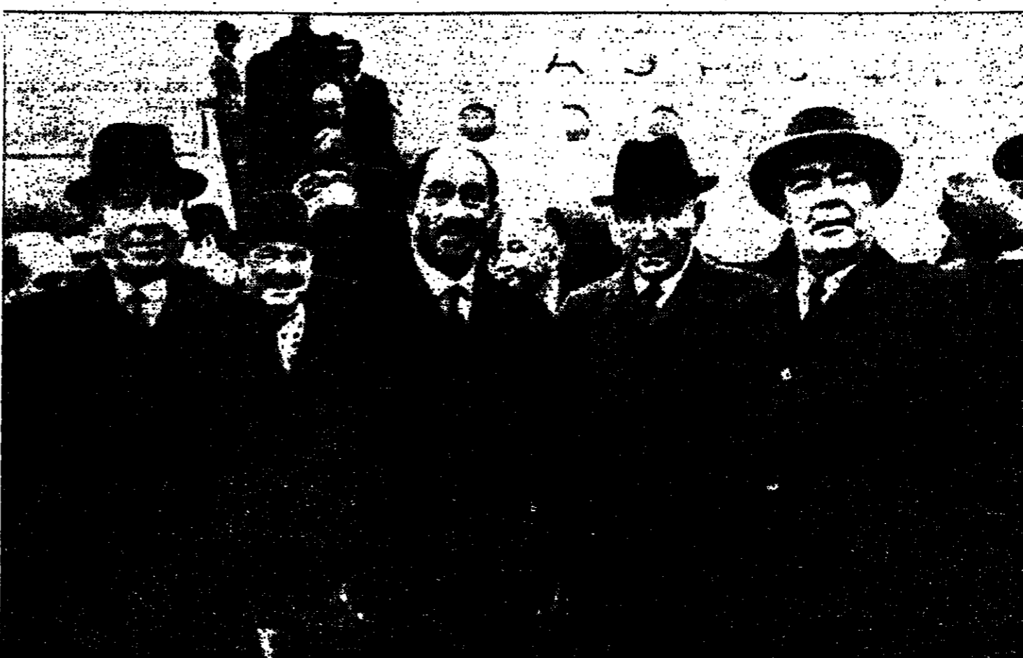
VIP ARRIVAL—From left to right at Moscow airport yesterday: Soviet President Nikolai Podgorny; Egyptian President Anwar Sadat; Soviet Premier Alexei Kosygin and Soviet Party Secretary Leonid Brezhnev.